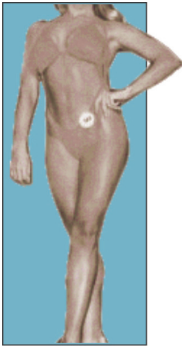
Bikini & Figure